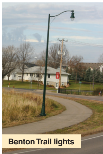
Benton Trail lights

■ The County Road 36 trail, along with park trails in Meadow Park and Marion Fields, are finished with just a few punch list items left. The County Road 36 trail is the second major trail project (following the Benton Lake Trail) and completes the trail connection of the community on