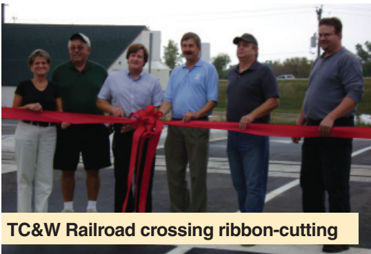
TC&W Railroad crossing ribbon-cutting