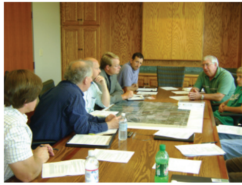
Representatives from the City, County, DNR and Benton Lake Conservancy are working to improve the lake's quality.