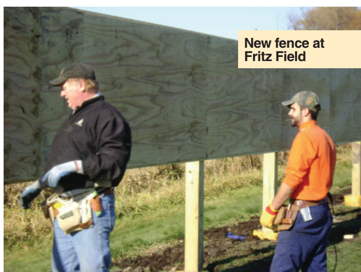
New fence at Fritz Field

The Cologne Hollanders are installing a new outfield fence at Fritz Field with materials supplied by the City of Cologne. The majority of the work will be completed in 2009 with finishing touches occurring in spring 2010.