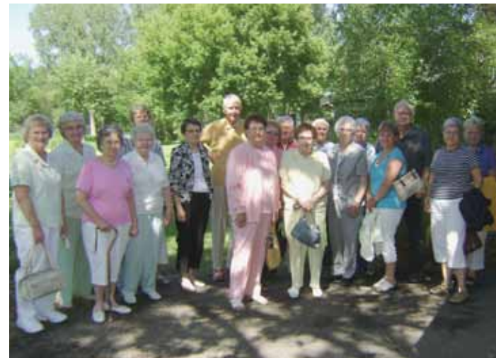
Members of the Cologne Area Seniors Group and their guests gathered outside of the Old Log Theater, the first of two summer outings planned by the group.

The Cologne Area Seniors are getting “out and about” this summer.